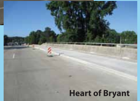
Heart of Bryant

MIDDLE RIGHT: New Fire Stations - One on South Reynolds Rd. at Hill Farm Rd. intersection (shown), and Second one on Northlake Rd. just off of Springhill Rd. Estimated Completion for both locations is End of October, 2018.