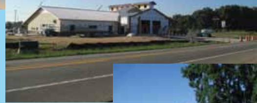
New Fire Station